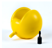
Ballfloat P/N: 7182112