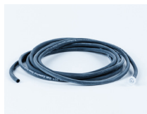
Last-o-More tubing available per meter 5x8mm P/N: 411-0018-039 3x5mm -P/N: 411-0018-038