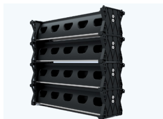
WatchGas SST Range 5-Way Stackable Charging Cradle P/N: SST-STACK-CHR (Extra's are needed)