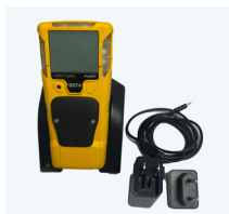
Universal cradle charger for SST Range P/N: SST-IND-S