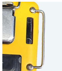
SST4 Lanyard bar (sold separately) P/N: SST4-POUL-10