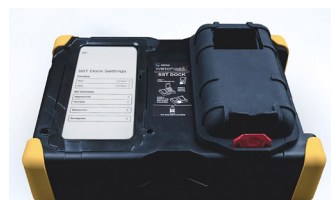
SST Dock P/N: SST-DOCK